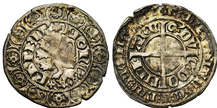
RUMEN type (Elsen 118-967)