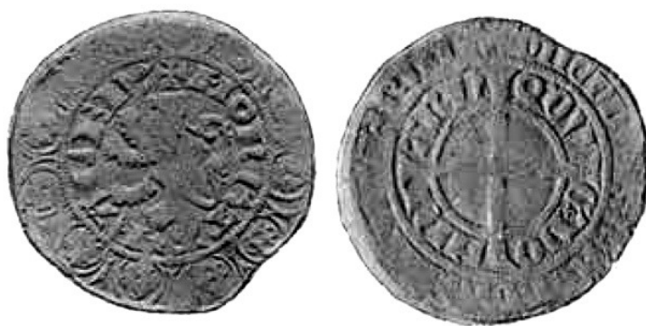
FALEN type (Byvanck 10) [5]