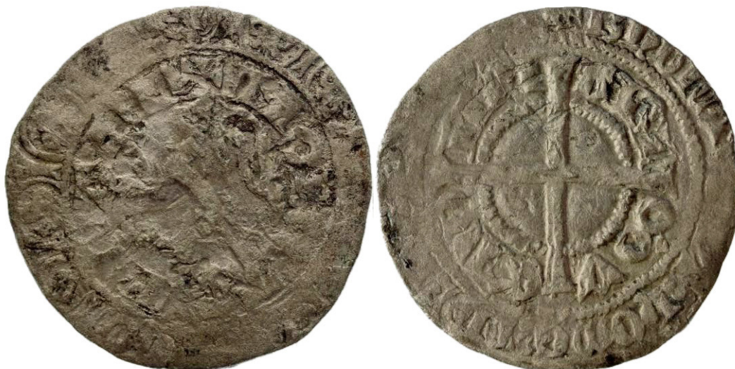
private collection / 2.27 g. / 25 mm.

In late 2016, an unusual and previously unpublished specimen came to light that does not fit into any of the categories described above. and does not match any known specimen. It was presumably struck in Rummen, although it may well be a medieval counterfeit (struck in Rummen or elsewhere). Its provenance is unknown, although it is said to have been in an old collection for many years.