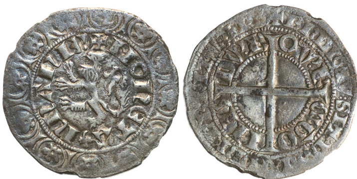
NNANE type (Torongo (2013) fig. 28-01 / 2.99 g. [9] )