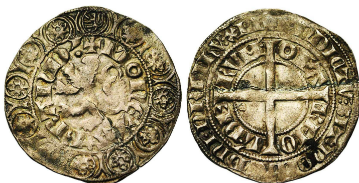
FRAND type (Elsen 118-968)