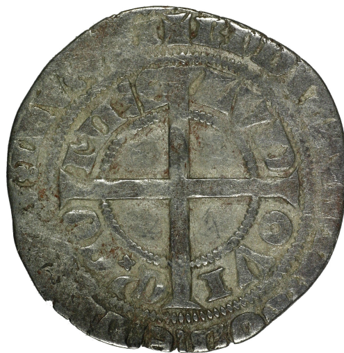
M 02847 / 2.5 g.