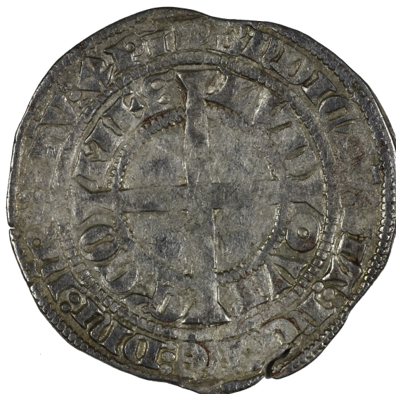
M 02893 / 3.5 g.