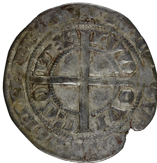
M 02884 / 2.8 g.