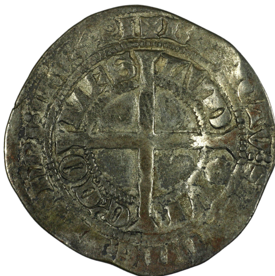
M 02880 / 2.9 g.