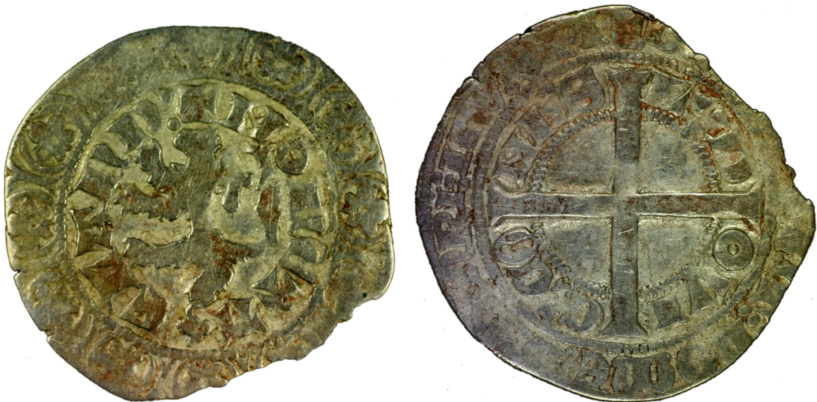
M 02985 / 2.7 g.

'Normal' N's obverse (reverse illegible), 'wedge' L's, possible sharp C's and 'indent' D's.