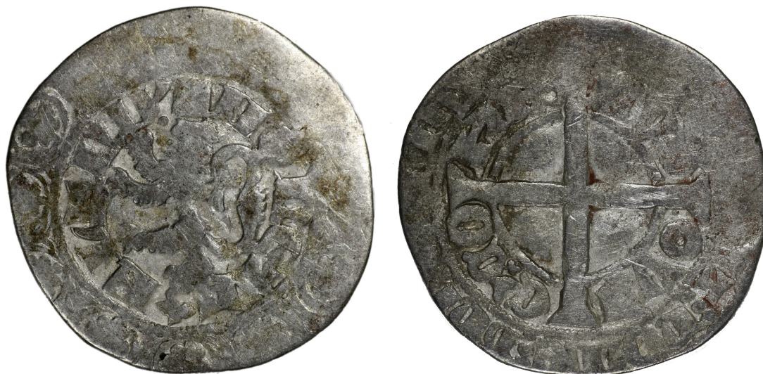
M 02920 / 2.7 g.

Clearly has ‘rounded’ C’s in the reverse, inner legend and a ‘curvy’ L in FLAND. The L of LVDOVIC is unclear and may even be ‘serif’ type (placing it in the sub-group of the same name). This piece is presumably belongs to either the ‘narrow’, ‘curvy’, or ‘serif’ L group.