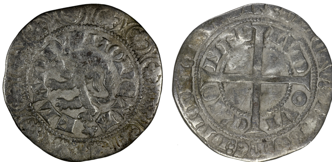
M 02935 / 2.6 g.

'Normal' N's, 'wedge' L on the obverse. Although this is probably an Issue V, 'rough' style coin, this is one of the pieces where Issue VI cannot be ruled out as a possibility. The A of FLAND appears to have a low-sitting crossbar (indicating Issue V).