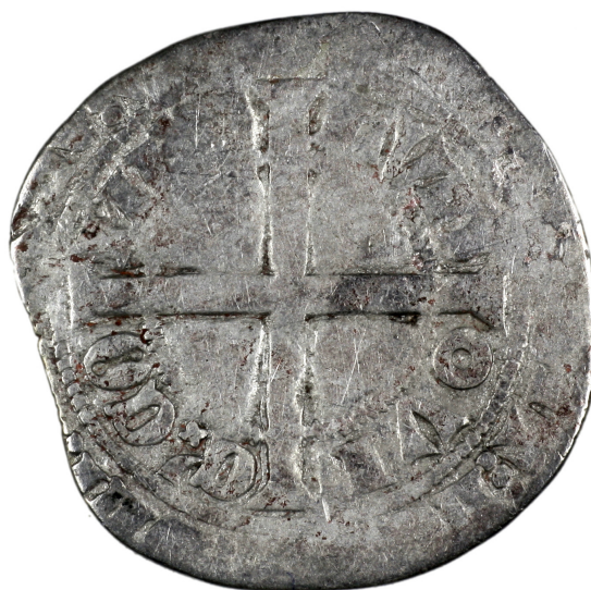
M 02965 / 2.3 g.