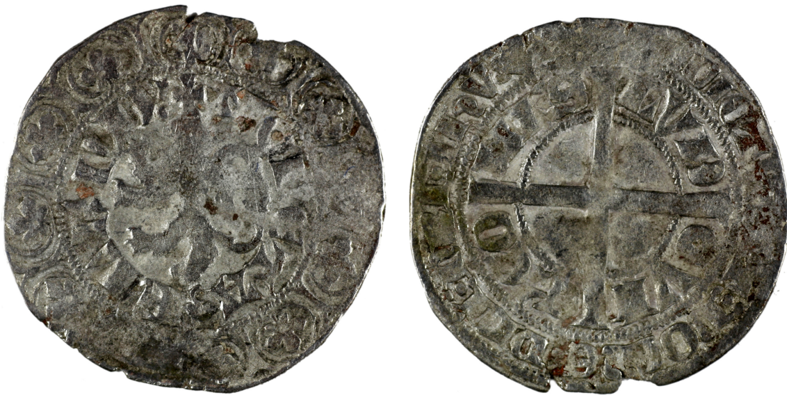
M 02960 / 2.8 g.

There are 'wedge' L's on both faces, an 'indent' D in LVDOVIC, and probable sharp C's. The rest of the coin is unclear, except for a leaf-stem that may indicate a 'refined' style piece.