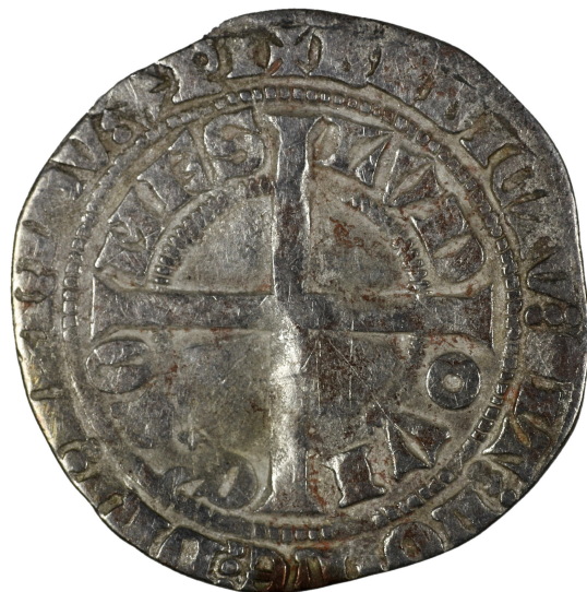
M 02924 / 2.5 g.