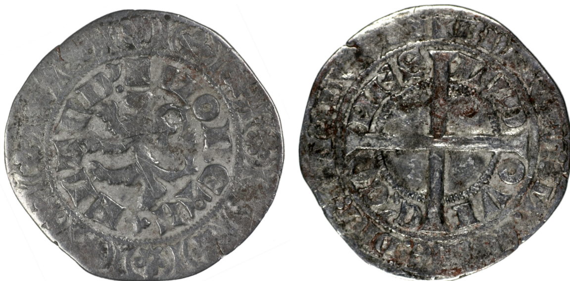
M 02945 / 2.2 g.

The N's on both faces seem 'normal', the reverse, inner legend C's seem 'rounded'. The L on the reverse appears to have a 'wedge foot'. Although it also seems to have a fairly large serif on the ascender, the other letters do not conform to the so-called 'serif' L type. The L on the obverse appears to be a 'curvy' type. A 'wedge' L reverse and 'curvy' L obverse put the coin into the 'narrow' L sub-group, despite the fact that the obverse L is not as narrow as those seen on other known coins of this sub-group.