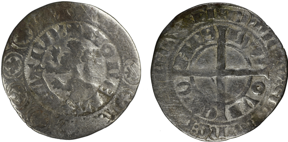
M 02937 / 2.9 g.

Very little about this coin is clear, other than the 'wedge' L's and probable 'normal' N's. The C's appear to be sharp. The leaf stem implies a 'refined' style coin.