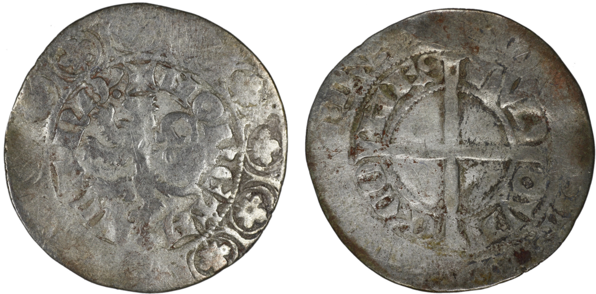
M 02905 / 2.3 g.

The L of FLAND appears to be ‘curvy’, while the L of LVDOVIC is unclear. The C ’s in the reverse, inner legend appear to be ‘sharp’. A ‘curvy’ or ‘narrow’ L on the obverse combined with ‘sharp’ C ’s on the reverse would indicate the ‘narrow’ L group and no other. The T of MON ETA is very small.