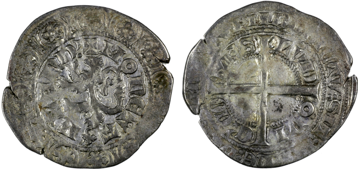
M 02970 / 2.3g

Coins with these attributes do not come from the sub-group 'refined' style. Coins with 'curvy' L's also do not come from the 'rough' style or the 'footless' N groups.