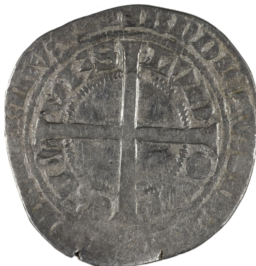
M 02950 / 2.4 g.