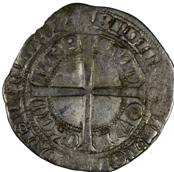
M 02940 / 2.6 g.