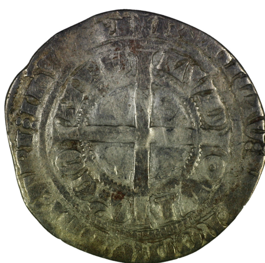
M 02850 / 2.5 g.