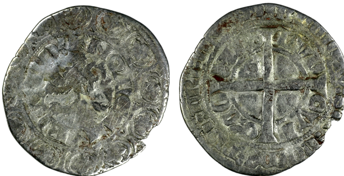
M 02967 / 2.7 g.

Clearly has ‘rounded’ C’s in the reverse, inner legend and a ‘curvy’ L in FLAND. The L of LVDOVIC is unclear and may even be ‘serif’ type (placing it in the sub-group of the same name). This piece is presumably belongs to either the ‘narrow’, ‘curvy’, or ‘serif’ L group.