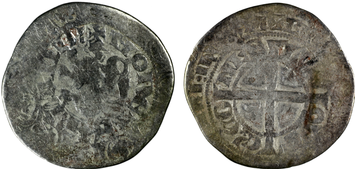
M 02952 / 2.5 g.

'Normal' N's, possible 'indent' D in COMES, possible 'wedge' L in LVDOVIC, possible sharp C's. The L of FLAND is clearly not a 'wedge', and is probably a 'narrow' type. This coin probably belongs to the 'narrow' L sub-group.