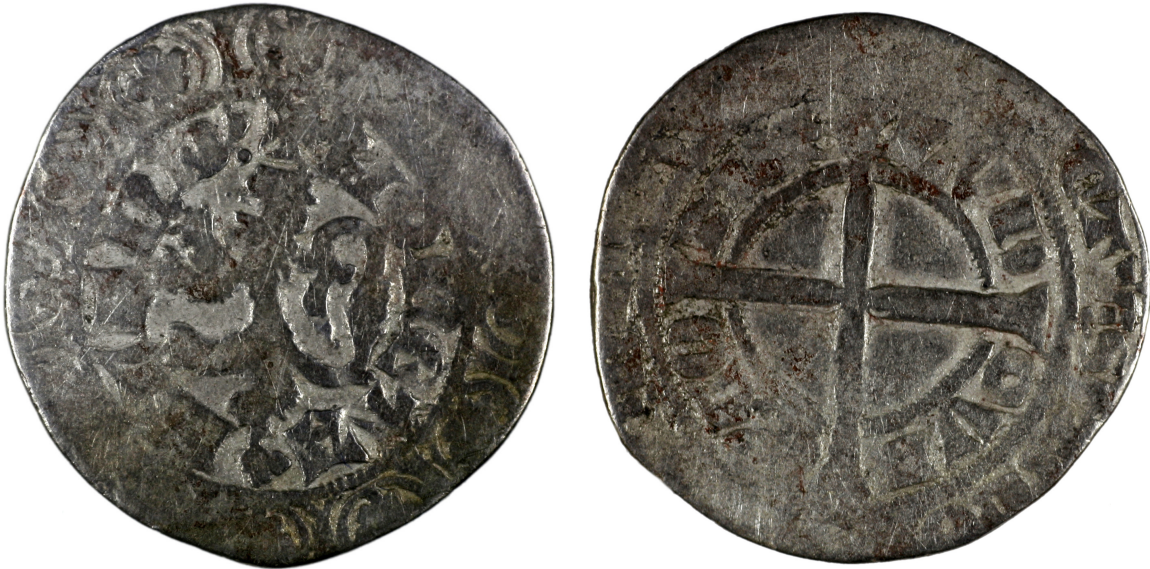
M 02951 / 2.7 g.

'Normal' N's, possible 'indent' D in COMES, possible 'wedge' L in LVDOVIC, possible sharp C's. The L of FLAND is clearly not a 'wedge', and is probably a 'narrow' type. This coin probably belongs to the 'narrow' L sub-group.