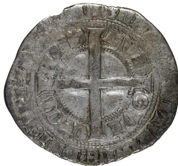
M 02922 / 2.6 g.