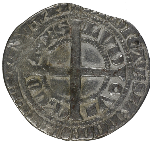
M 02874 / 2.0 g.