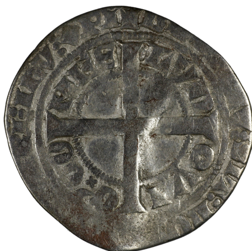
M 02831 / 2.7 g.