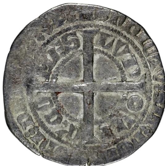
M 02961 / 2.9 g