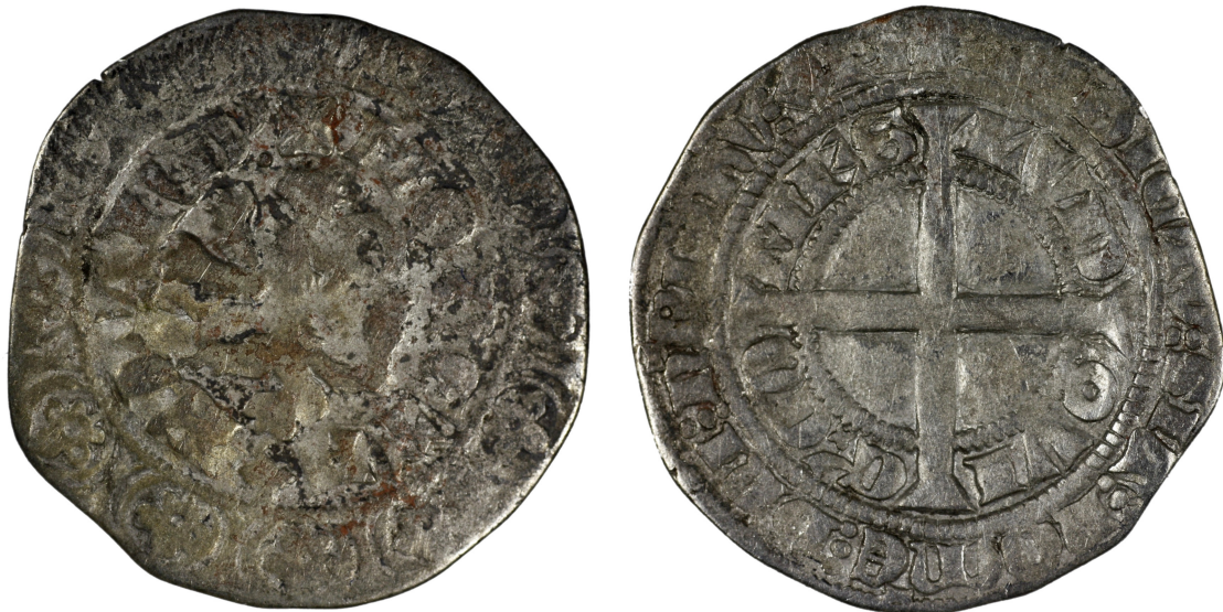
M 02938 / 2.8 g.

Very little about this coin is clear, other than the 'wedge' L's and probable 'normal' N's. The C's appear to be sharp. The leaf stem implies a 'refined' style coin.