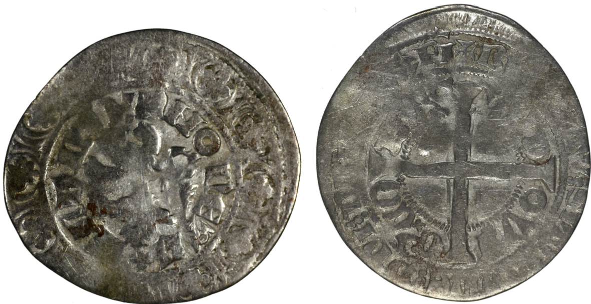
M 02926 / 2.3 g.

Appears to have 'rounded' C's in the reverse, inner legend. The L of LVDOVIC is a 'wedge' L, the L of FLAND is probably 'wedge' as well, although it does have a slight curve to it. The T of MONETA is fairly small, and the reverse of the coin is double-struck. Probably a 'rough' style coin.