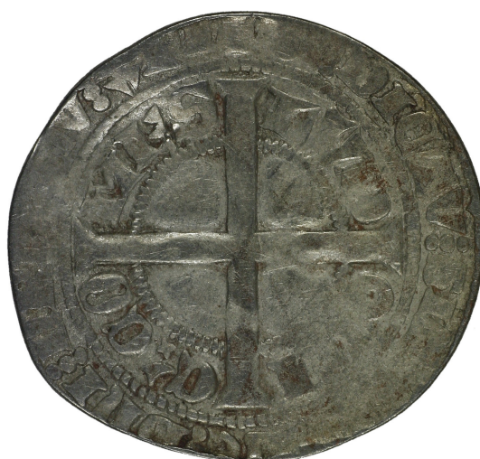
M 02858 / 2.6 g.