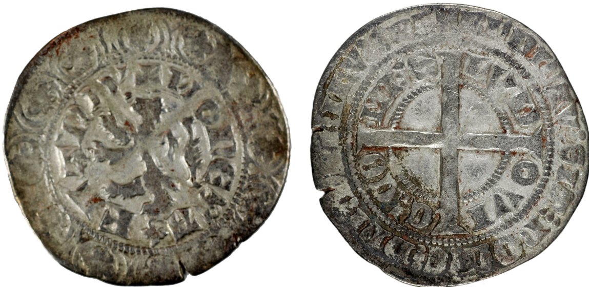
M 02964 / 2.4 g.

There are 'wedge' L's on both faces, an 'indent' D in LVDOVIC, and probable sharp C's. The rest of the coin is unclear, except for a leaf-stem that may indicate a 'refined' style piece.