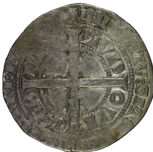
M 02853 / 2.7 g.