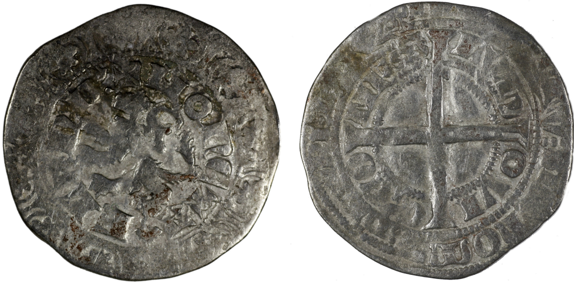
M 02923 / 2.4 g.

Appears to have 'rounded' C's in the reverse, inner legend. The L of LVDOVIC is a 'wedge' L, the L of FLAND is probably 'wedge' as well, although it does have a slight curve to it. The T of MONETA is fairly small, and the reverse of the coin is double-struck. Probably a 'rough' style coin.