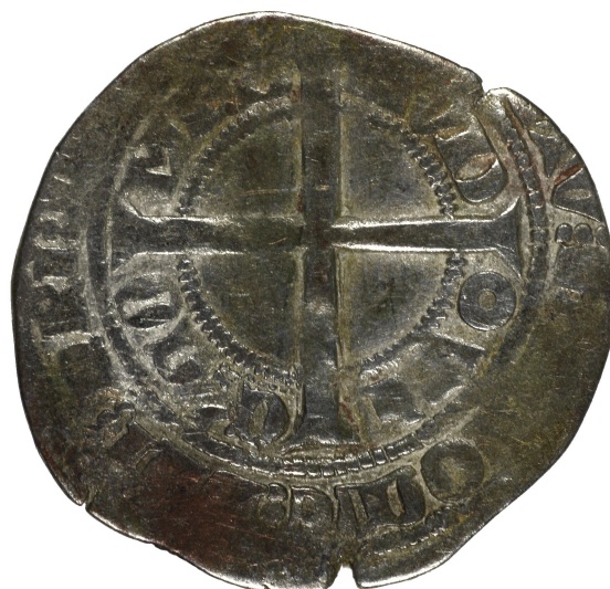
M 02889 / 2.9 g.