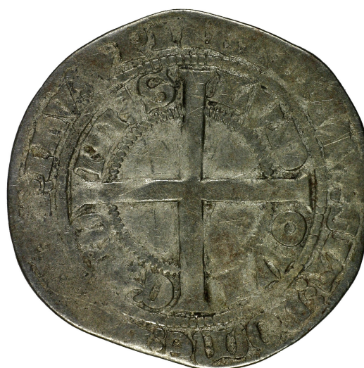
M 02862 / 2.8 g.