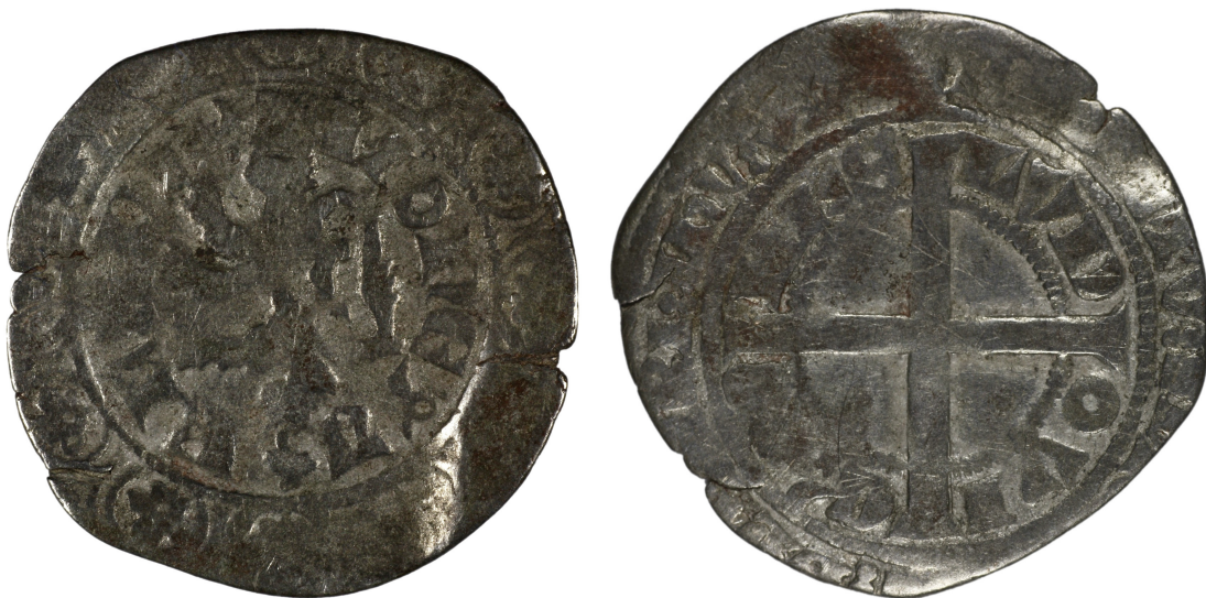
M 02891 / 2.6 g.

Coins with these attributes do not come from the sub-group 'refined' style. Coins with 'curvy' L's also do not come from the 'rough' style or the 'footless' N groups.