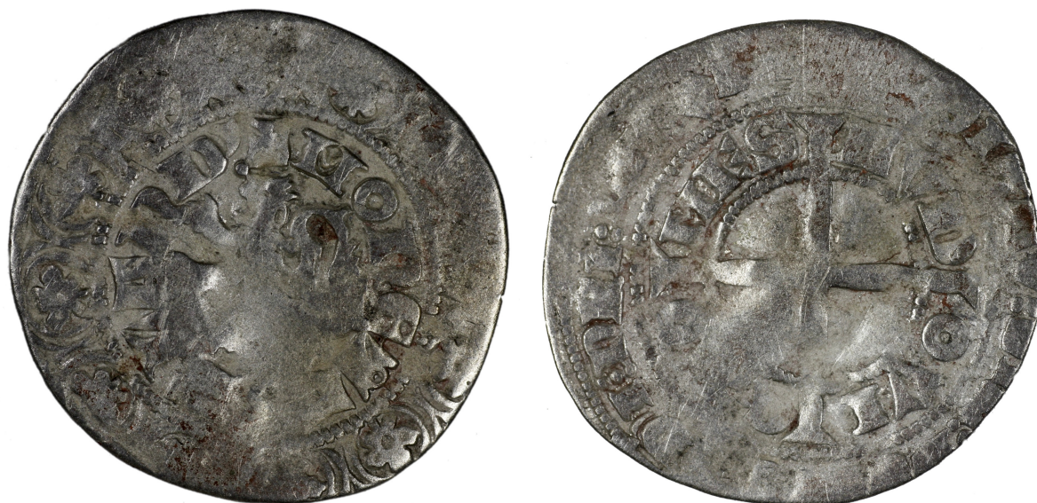
M 02918 / 2.1 g,

'Normal' N's, 'wedge' L on the obverse. Although this is probably an Issue V, 'rough' style coin, this is one of the pieces where Issue VI cannot be ruled out as a possibility. The A of FLAND appears to have a low-sitting crossbar (indicating Issue V).