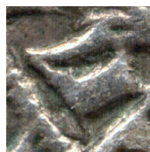
'narrow' L's on other coins