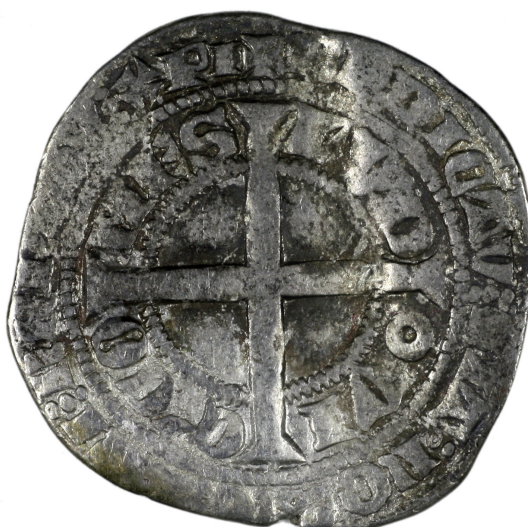
M 02959 / 2.7 g.