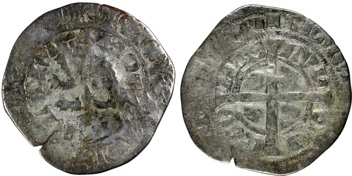
M 02974 / 2.8 g.

'Normal' N's obverse (reverse illegible), 'wedge' L's, possible sharp C's and 'indent' D's.