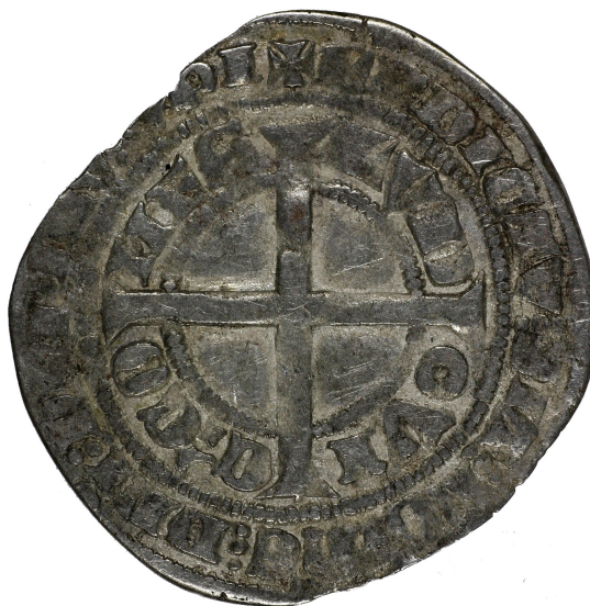
M 02865 / 2.7 g.