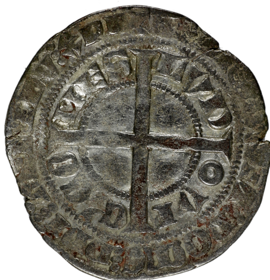
M 02962 / 2.8 g.