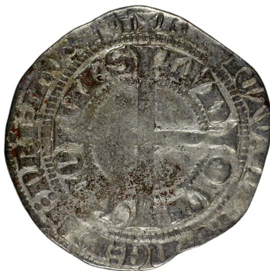
M 02949 / 2.5 g.