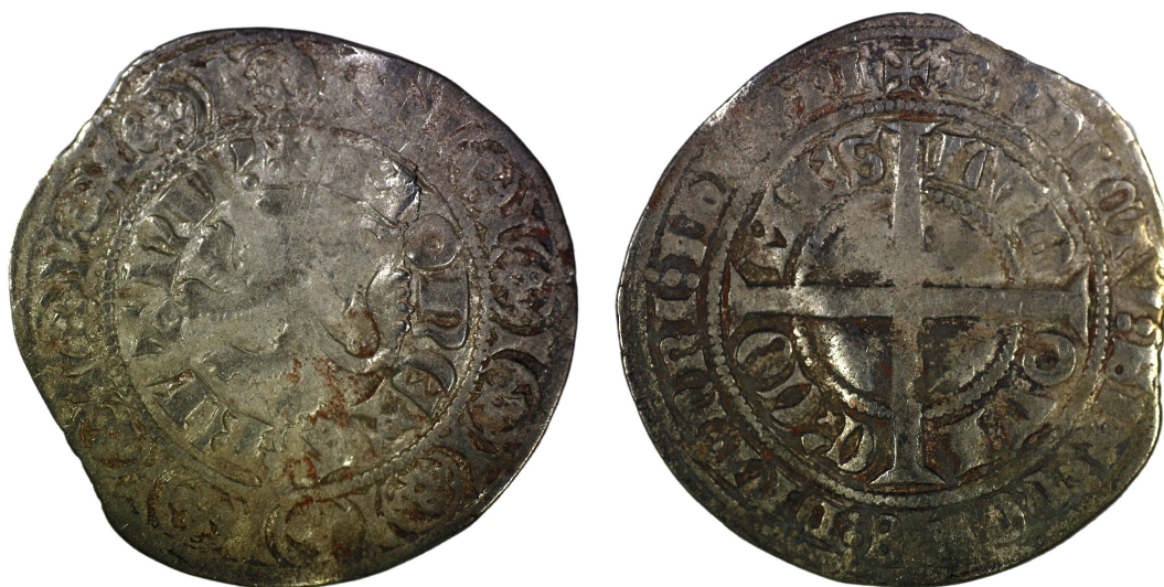
M 02882 / 2.6 g.