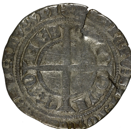
M 02892 / 2.7 g.