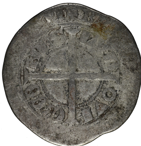
M 02921 / 2.7 g.