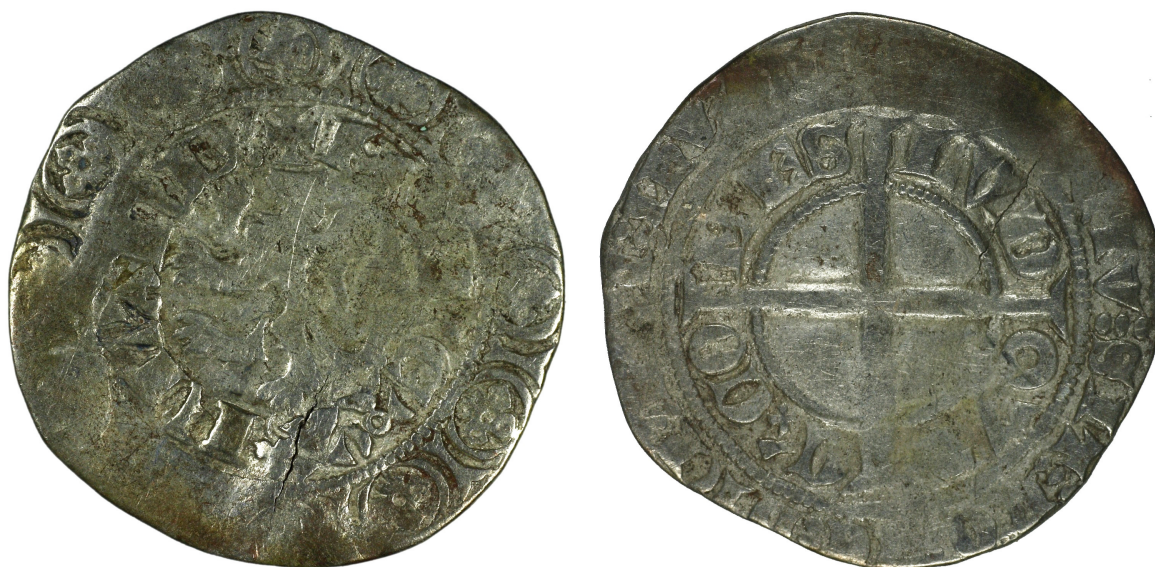
M 02838 / 2.9 g.