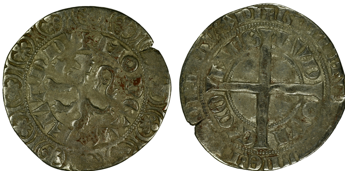
M 01478 / 2.45 g. – not from the Zutphen hoard

Although this coin is not part of the Zutphen Hoard, it is part of the SMZ collection. The coin appears to belong to the Issue V, ‘footless’ N sub-group (‘footless’ N’s also on reverse).