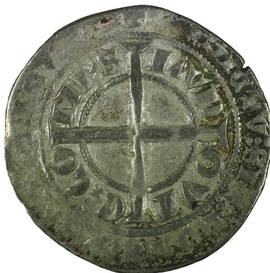
M 02843 / 2.5 g.