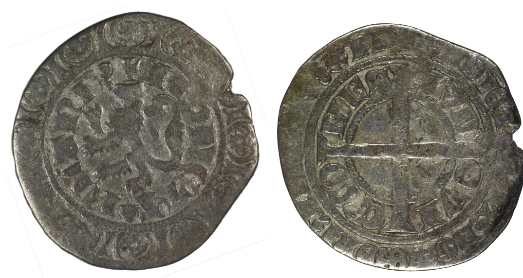
M 02867 / 2.9 g.