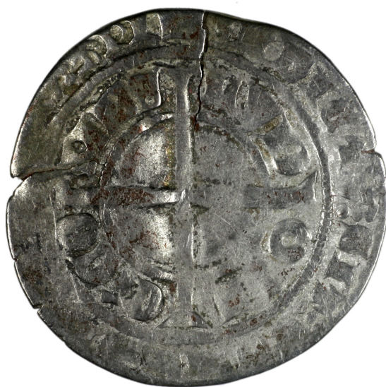
M 02963 / 3,0 g.