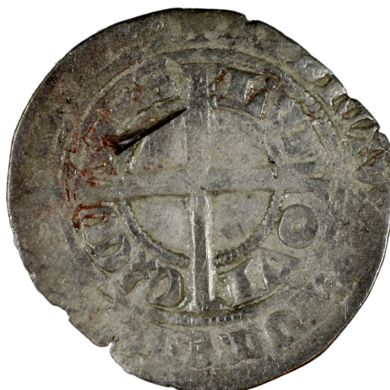
M 02975 / 2.8 g.