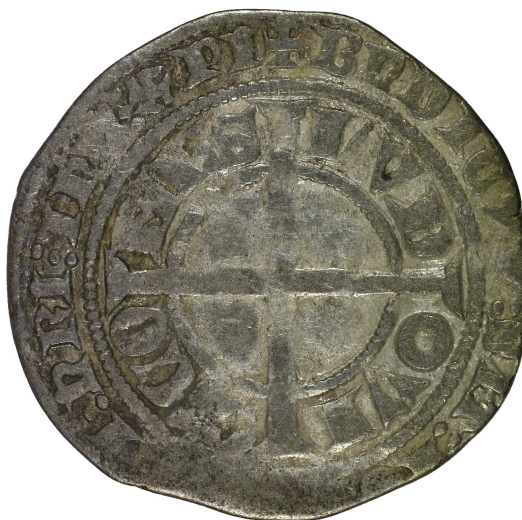
M 02879 / 2.8 g.