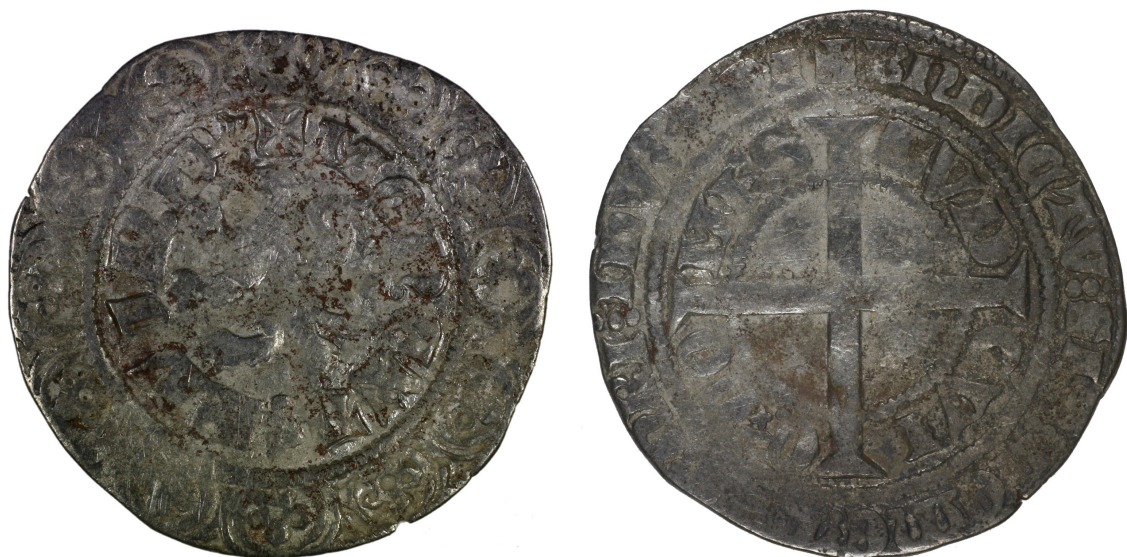
M 02842 / 2.6 g.