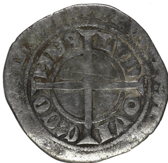
M 02939 / 2.9 g.