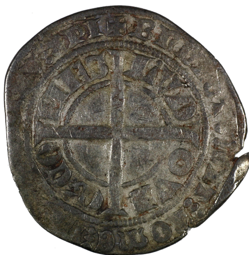
M 02881 / 2.4 g.