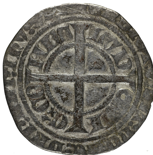
M 02902 / 2.1 g.