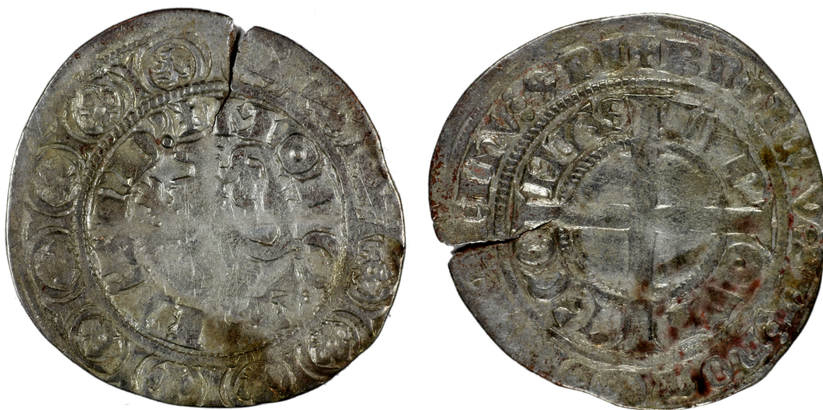
M 02978 / 2.3 g.