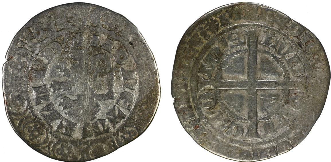
M 02834 / 2.6 g.

Note that the L's are once again 'wedge' L's, while the C's of the reverse, inner legend remain 'rounded'.