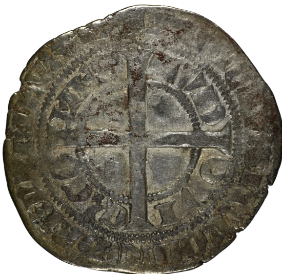
M 02885 / 2.7 g.