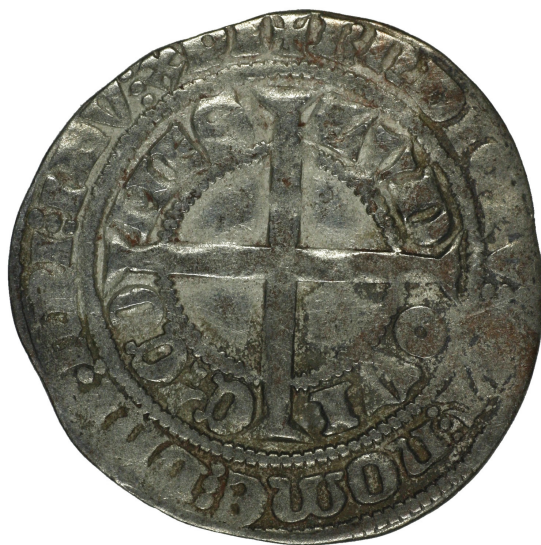
M 02851 / 2.4 g.