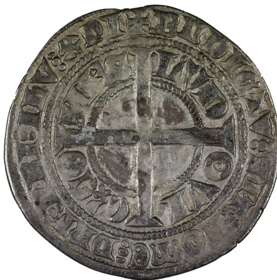
M 02841 / 2.2 g.