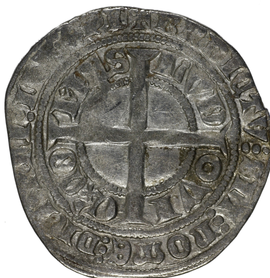
M 02933 / 3.1 g.