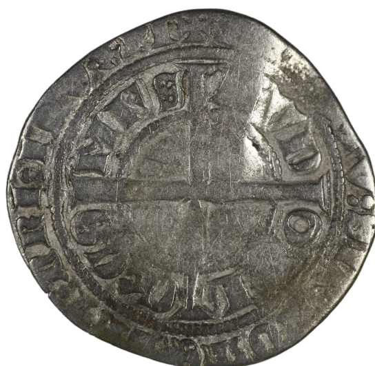
M 02934 / 2.6 g.