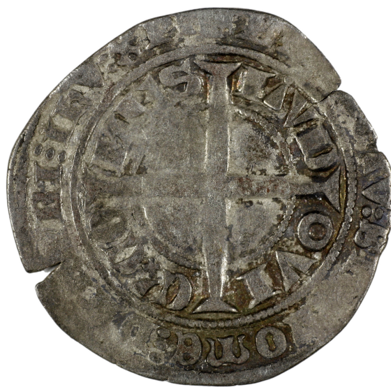
M 02977 / 2.5 g.