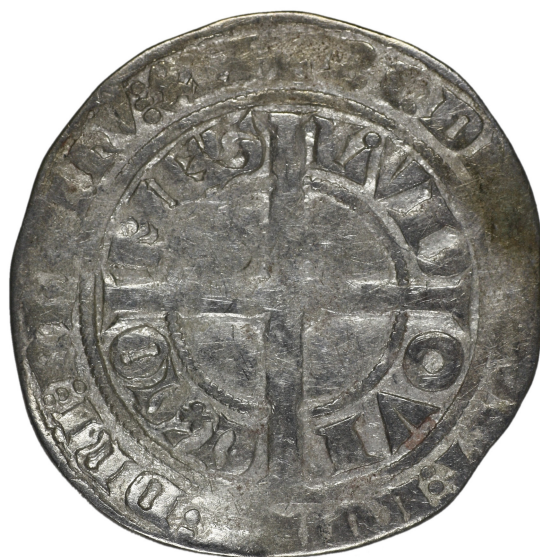
M 02911 / 2.5 g.