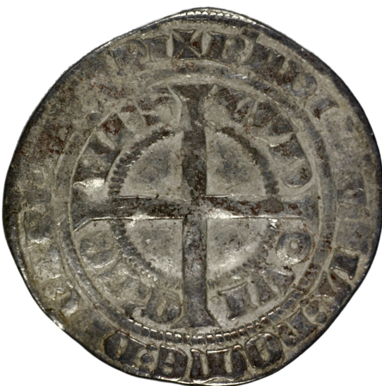
M 02906 / 2.5 g.