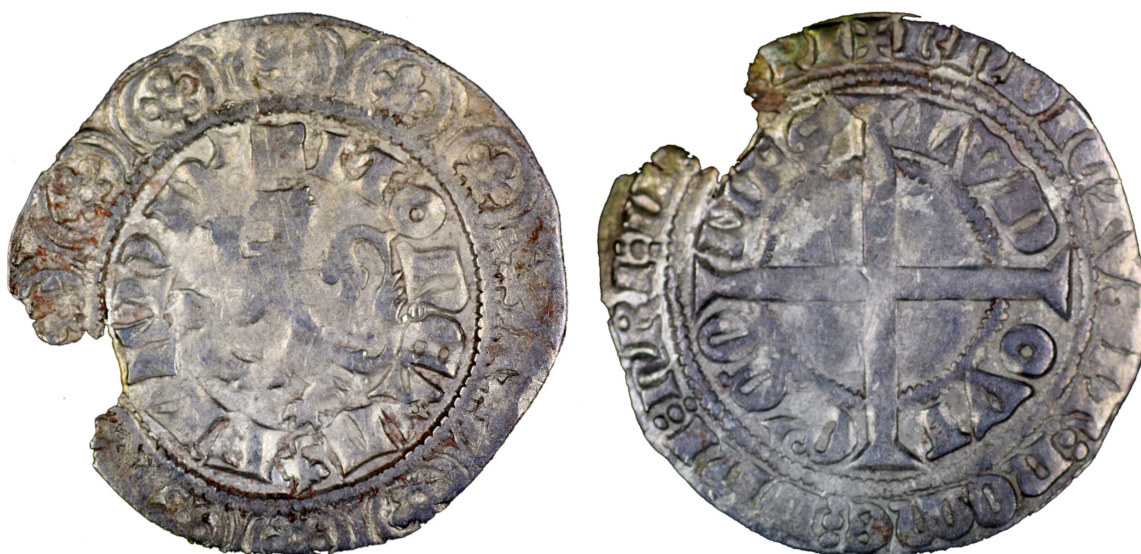
M 02982 / 2.4 g.