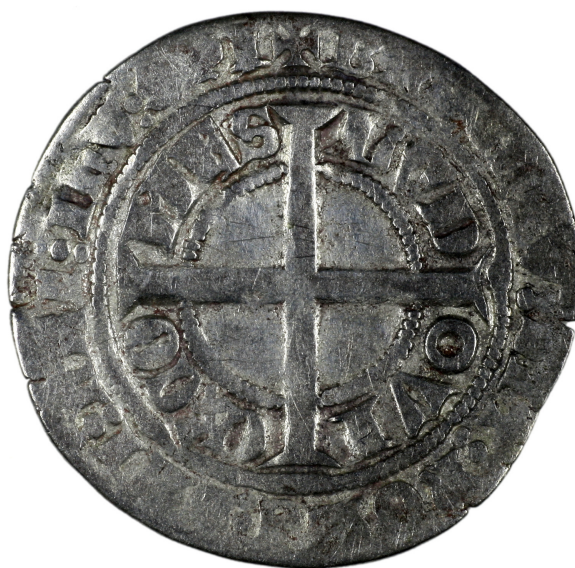
M 02956 / 2.5 g.