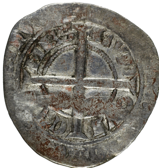
M 02957 / 2.4 g.