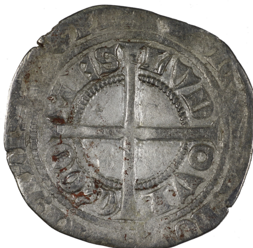
M 02941 / 2.3 g.