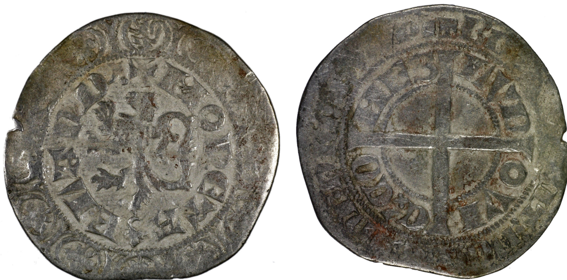
M 02864 / 2.6 g.