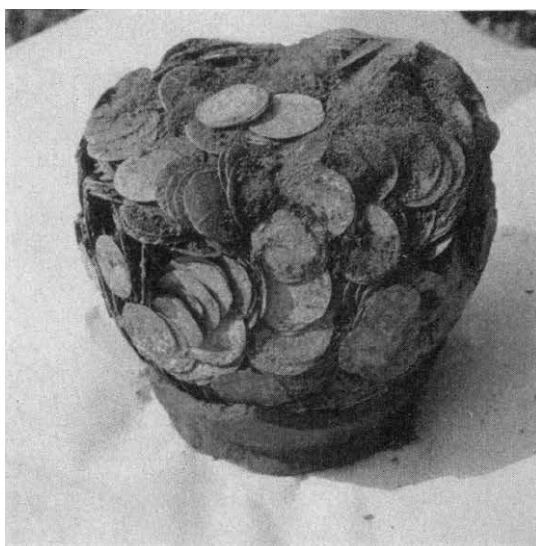
The Zutphen Hoard before separation and cleaning

On p. 29 is photo of the hoard before separation and cleaning, as well as a brief description of the hoard, taken from van Gelder [2] :