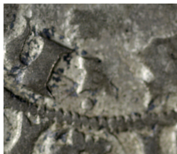
M 03141: pellet above the leaf mark