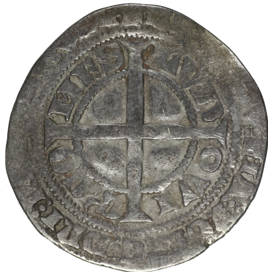
M 02914 / 2.9 g.