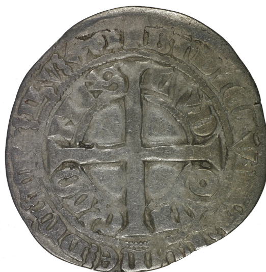
M 02849 / 2.9 g.