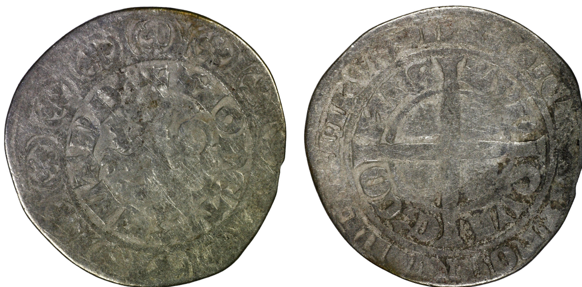
M 02859 / 2.9 g.

The sub-group characterized by a 'footless' N on the obverse: N , is represented in the SMZ collection by at least 8 coins. Some of the coins of this group have 'footless' N 's in the reverse, outer legend as well, while others have N 's that seem to show a mutilation of the dies from 'normal' letters to 'footless'. Coins of this group also have 'wedge' L 's on both faces and 'sharp' C 's in the reverse inner legend.