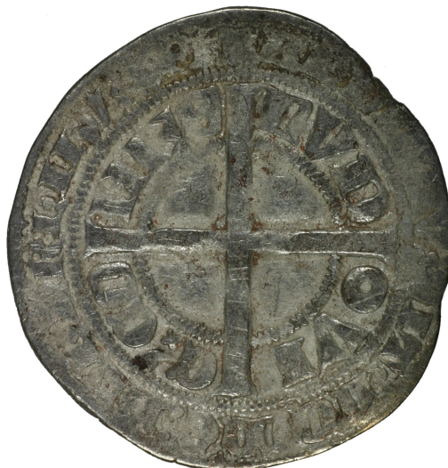
M 02873 / 2.6 g.