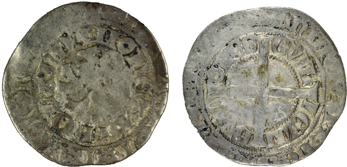
M 03141/ 1.90 g.

Of the original 8 Holland leeuwengroten from the Zutphen Hoard, this is the only one now in the SMZ collection. From the photograph, it is difficult to see the T and A of MONETA . There is a pellet above the leaf-mark before HOLAND .