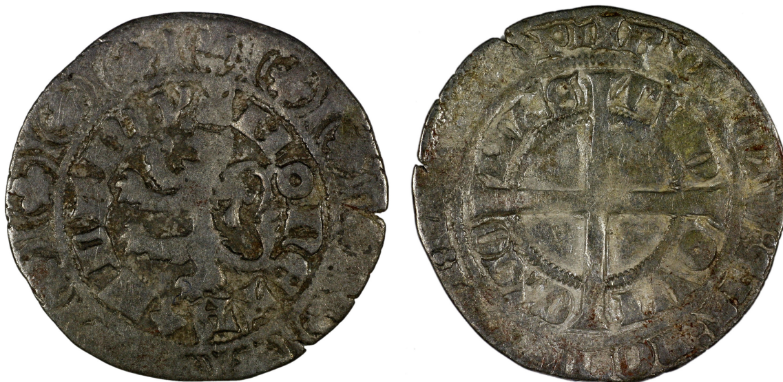
M 02869 / 2.8 g.

as identifiers for the less-legible coins. Having said that, 2 of the 23 coins categorized as illegible may be from the ‘narrow’ L sub-group: M-02951 (‘sharp’ C’s) and M-02945 (‘rounded’ C’s) (see Appendix C ).