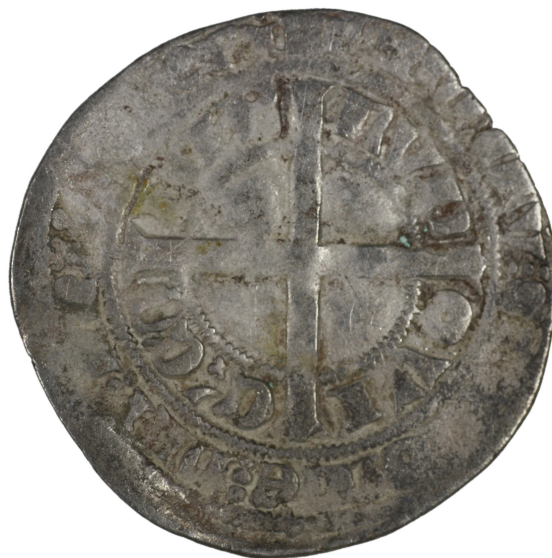
M 02908 / 2.4 g.