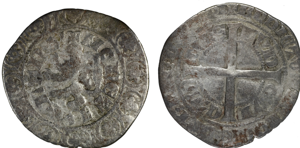
M 02915-o / 2.3 g.