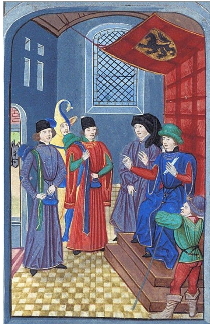
Louis II of Flanders (Louis of Mâle) Illustration from The Chronicles of Sir John Froissart

gebleven? [7] , which roughly translates as: Where, oh where, did the coin treasure of 1958 go? reflects the general tone of his piece, which mourns the dispersion of this important hoard into the mists of ambiguity. Rietdijk states that the SMZ had 31 gold and 900 silver coins from the find in its collection in 2008 (we doubt that those numbers have since changed). According to Rietdijk, this is just 37% of the original hoard remaining in the SMZ. [7]