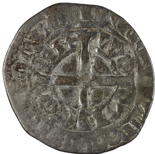
M 02919 / 2.4 g.