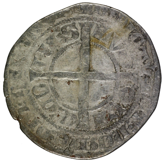
M 02852 / 2.6 g.