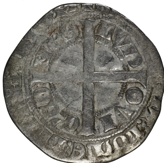
M 02903 / 2.5 g.