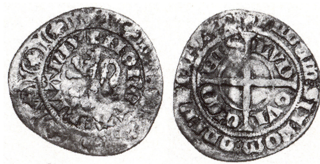
Elsen Auction 92 (9 June, 2007), item 960 \frac{1}{3} leeuwengroot from the Puister collection / 0.82 g. Is this coin from the Zutphen Hoard ?