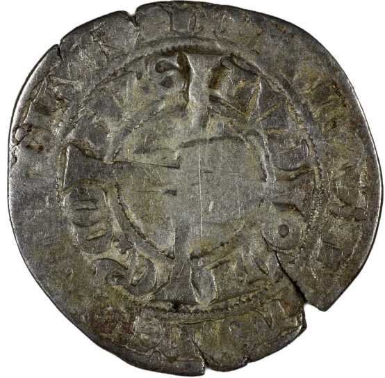
M 02896 / 2.8 g.