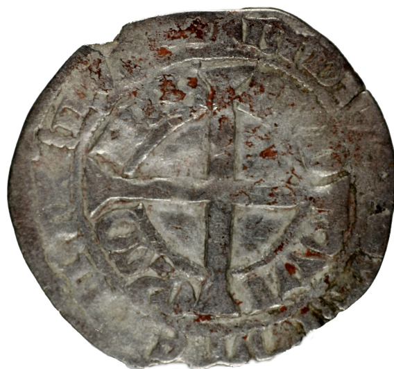
M 02969 / 2.8 g.