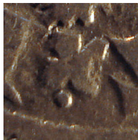
An example of a leaf-with-pellet mark after MONETA, in this case: ❧

{See our forthcoming paper on the Holland leeuwengroten for more information.}