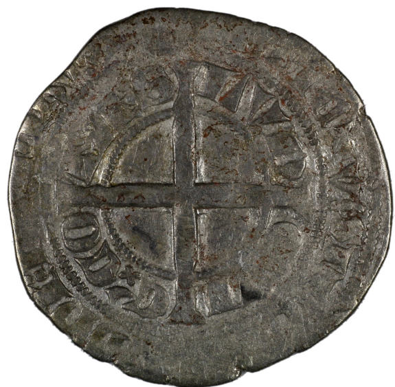
M 02856 / 2.6 g.