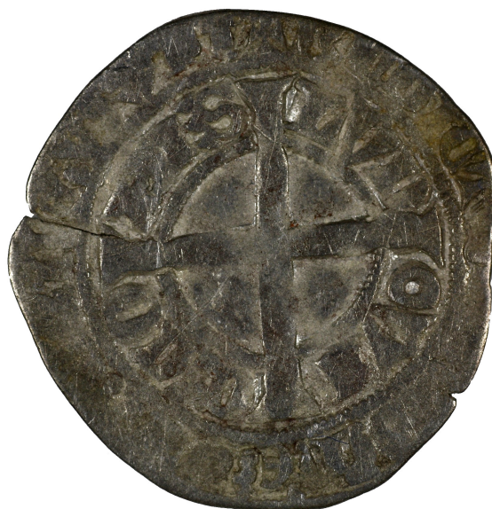
M 02894 / 2.8 g.