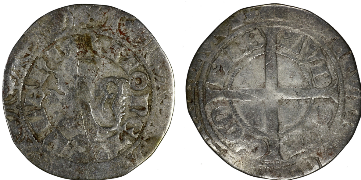
M 02901 / 2.1 g. mutilated N