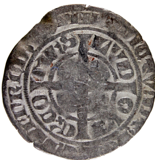
M 02953 / 2.7 g.