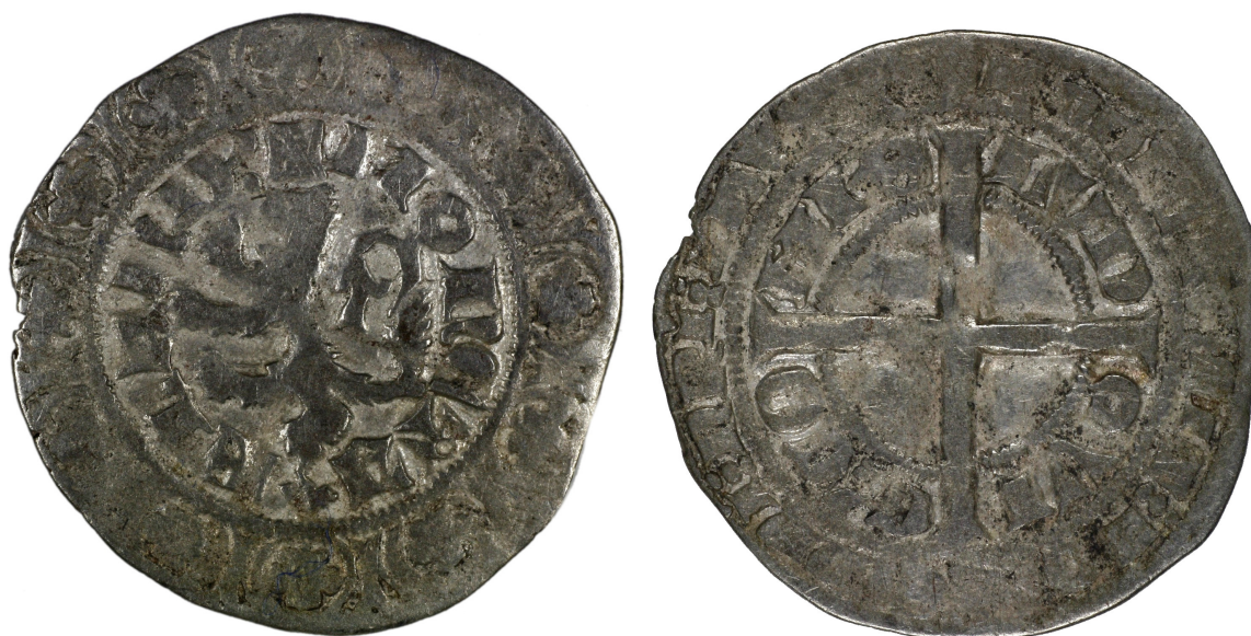
M 02848 / 2.3 g.

Recognition of a ‘curvy’ L coin is, in part, dependent on legible L’s in FLAND (‘curvy’) and in LVDOVIC (also ‘curvy’). Coins of this group have ‘rounded’ C’s in the reverse, inner legend – semi-legible coins with ‘sharp’ C’s can thus be eliminated as possible ‘curvy’ L group coins. We found at least 13 ‘curvy’ L pieces in the SMZ Zutphen Hoard coins.