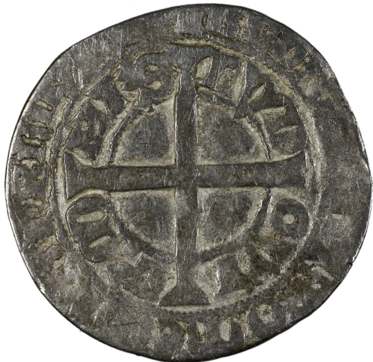
M 02913 / 2.8 g.