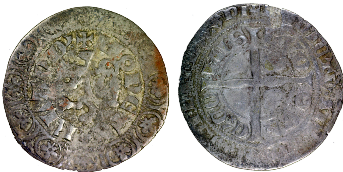
M 02980 / 2.6 g.