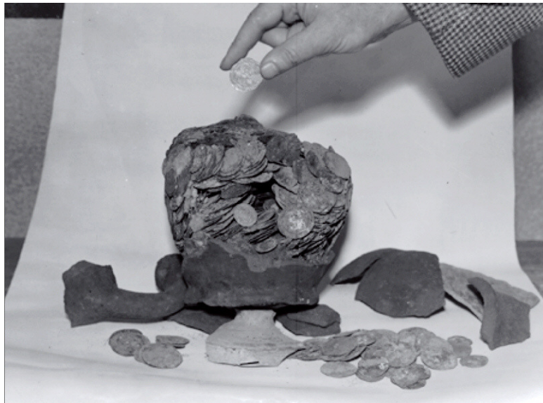
The Zutphen Hoard before separation and cleaning

The coins were found on 2 August, 1958, fused into what was basically a solid mass in the shape of an earthenware pot; the remains of said pot were found along with the coin mass. Several hundred silver coins had been deposited in the pot, followed by all of the gold coins (which did not fuse together with one another and remained loose over the centuries), after which the rest of the silver coins were placed inside. The implication is that the coins were all put into the pot at one time and not over a long period. A few loose coins were also found. [2]