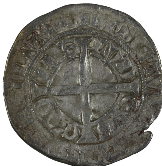
M 02890 / 2.6 g.