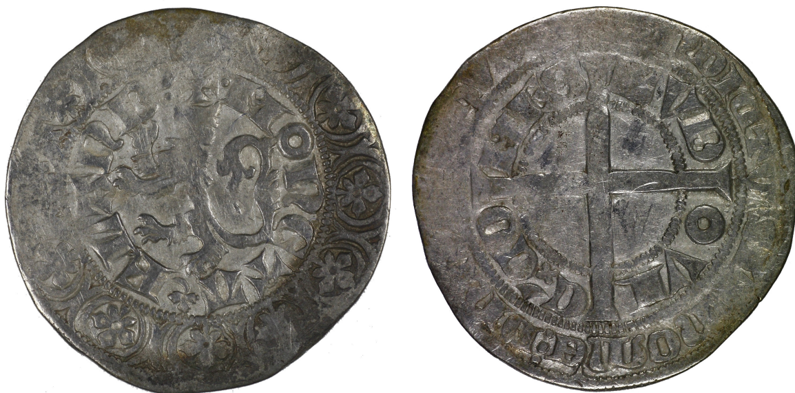
M 02861 / 3.5g.

2 examples: M 02861 / 3.5g. M 02868 / 3.0 g.