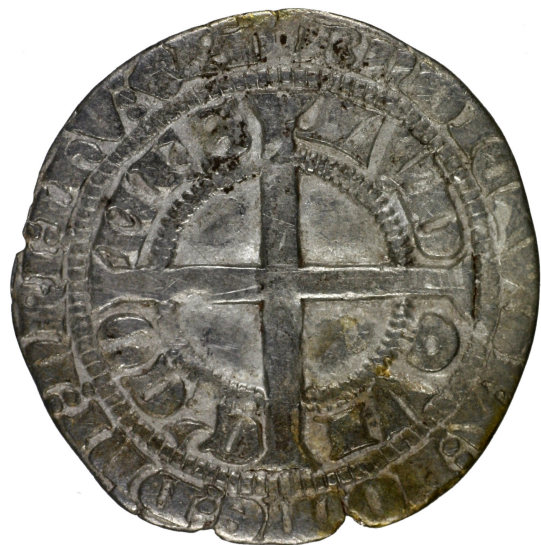
M 02878 / 2.1 g.