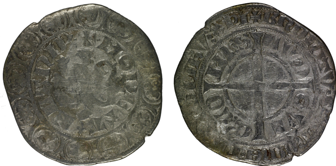
M 02868 / 3.0 g.