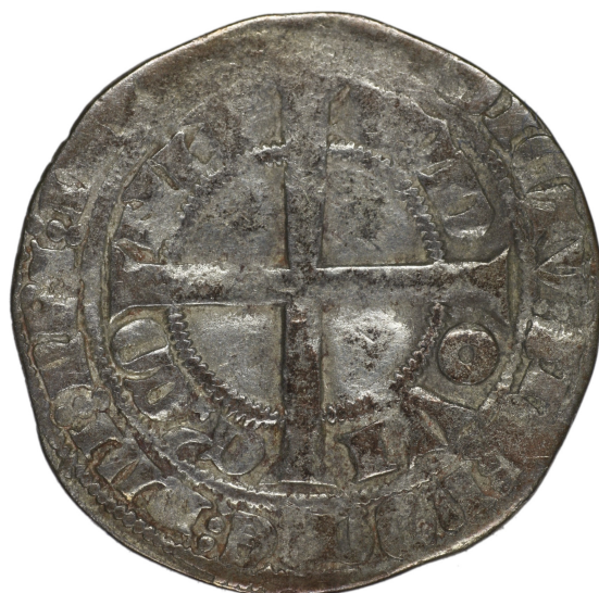
M 02904 / 2.7 g.