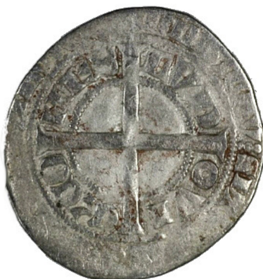
M 02907 / 2.80 g.