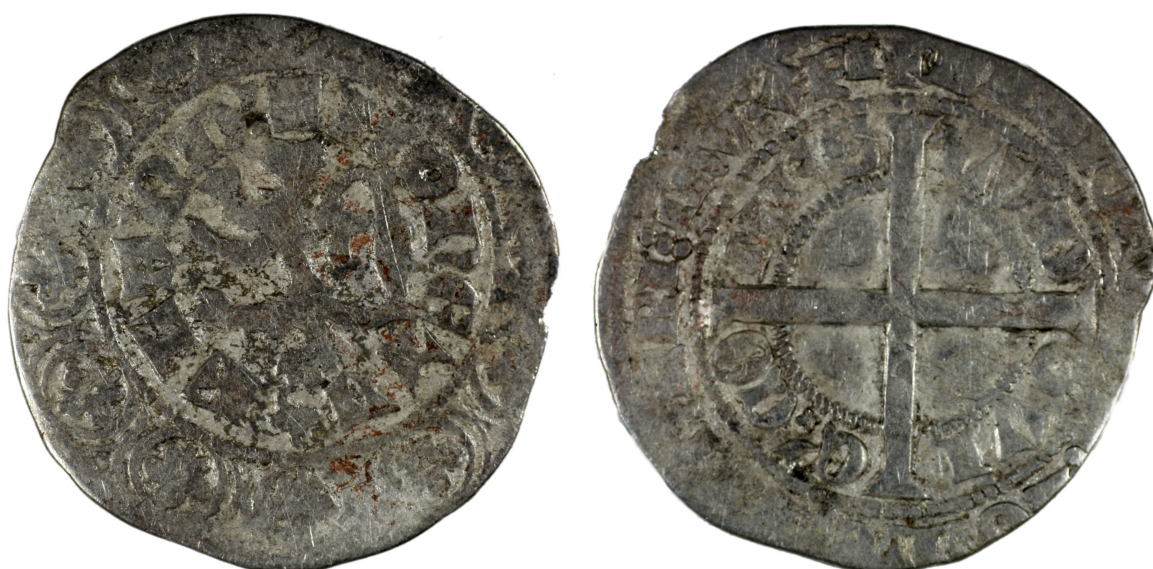
M 02958 / 2.2 g.