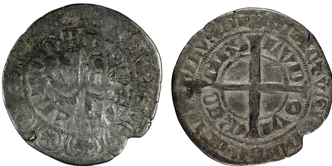
M 02966-o / 2.1 g.