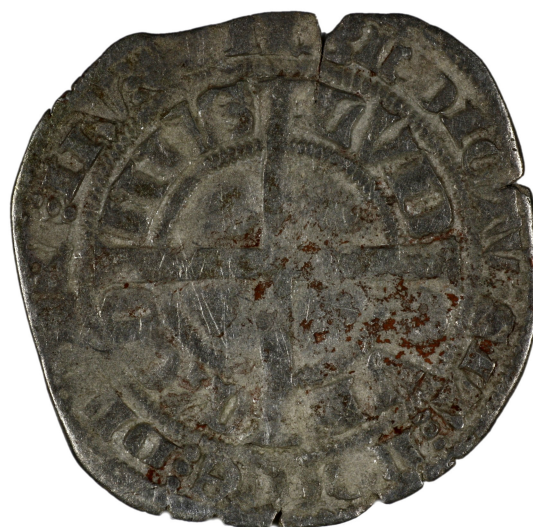
M 02887 / 2.5 g.