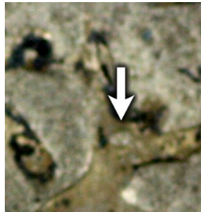
M 03141: the pellet left of the initial cross