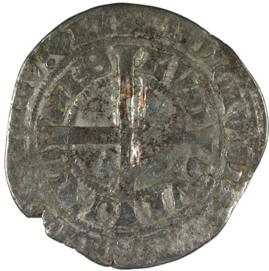
M 02888 / 2.7g.