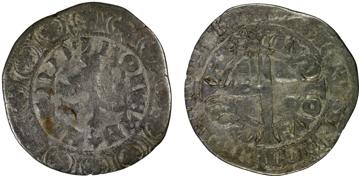
M 02844 / 2.6 g.