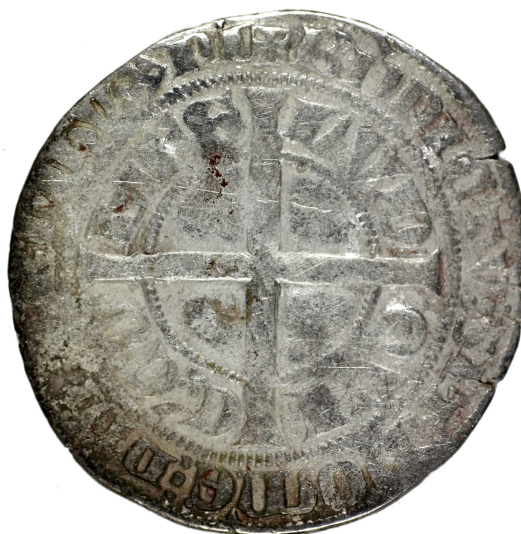
M 02955 / 2.9 g.