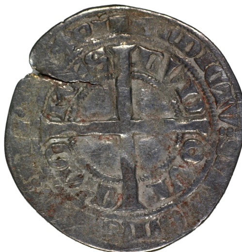
M 02981 / 2.2 g.