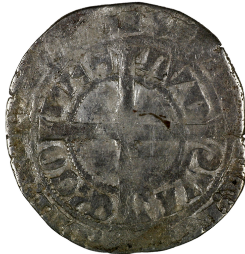
M 02845 / 2.4 g.