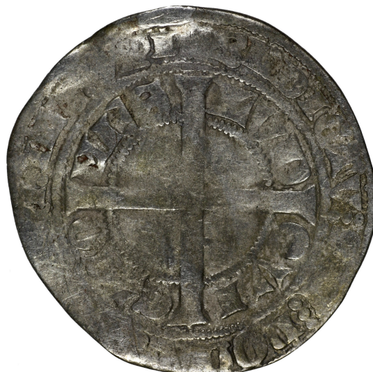
M 02916 / 2.5 g.