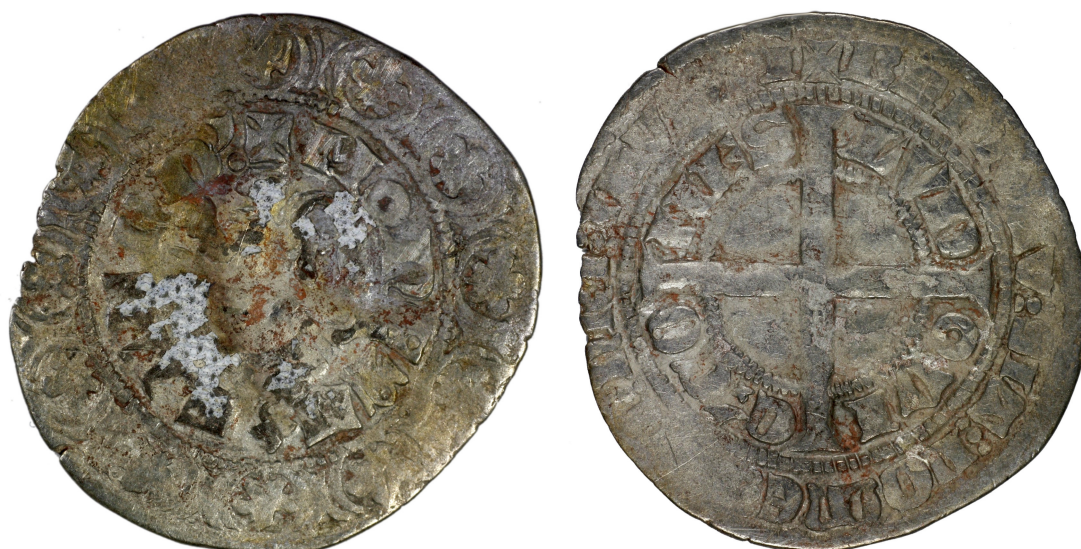
M 02835 / 2.4 g.

Although it can be difficult to separate ‘refined’ style coins from ‘rough’ style coins if the leaf-mark is illegible, if ‘rounded’ C’s are visible in the reverse, inner legend then the coins cannot be from the ‘refined’ style group. The following 9 coins are all thought to belong to the ‘rough’ style group, based upon their ‘wedge’ L’s and ‘rounded’ C’s: