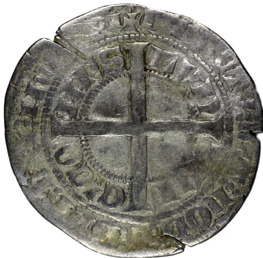
M 02897 / 2.7 g.