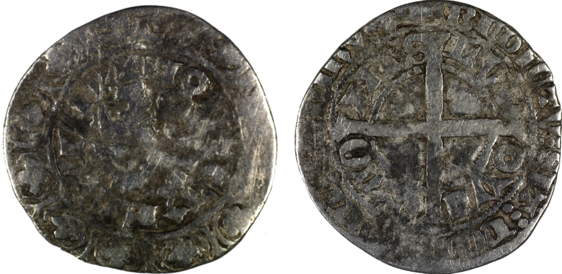
M 02839 / 2.6 g.

There are at least 10 coins present in the collection from the ‘serif’ L group. These coins have a ‘curvy’ L on the obverse, and in the reverse, inner legend: an L with a distinct, large serif, unusually large V’s, the letters MES often somewhat “jumbled up”, and ‘rounded’ C’s. The central cross is often rather wobbly. Another likely ‘serif’ L coin can be found in Appendix C (M-02967).