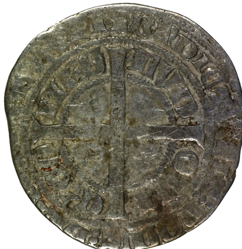
M 02857 / 2.5 g.