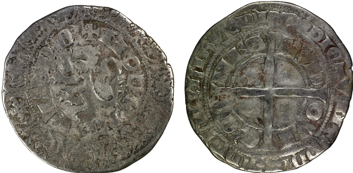
M 02871 / 3.0 g.