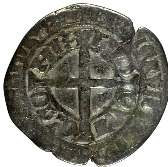
M 02976 / 2.6 g.