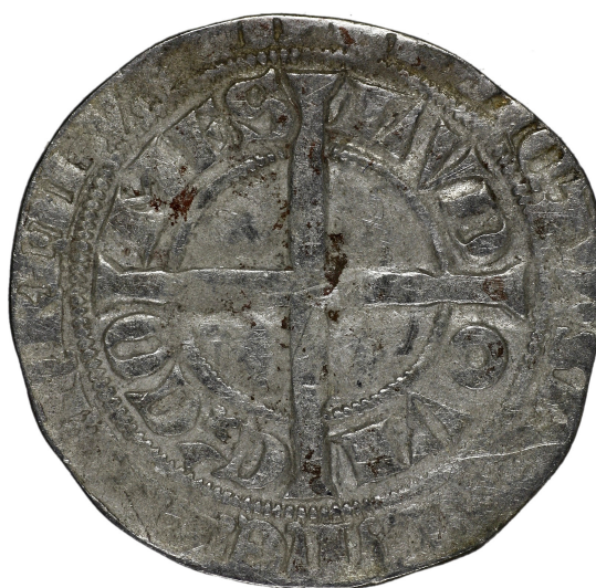
M 02909 / 2.6 g.