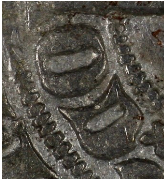
'sharp' C, long O (M 02856)