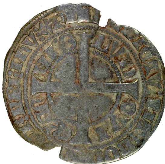
M 02984 / 2.8 g.