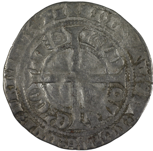
M 02836 / 2.8 g