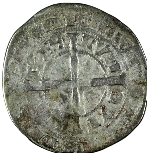
M 02948 / 2.5 g.