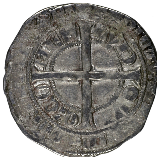
M 02946 / 2.2 g.