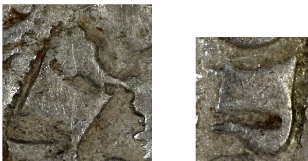
The obverse N's of M-02901 (detail)