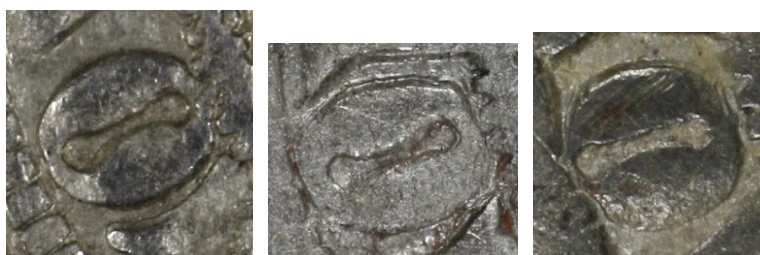
‘Keyhole’ long O’s in COMES

The long O in COMES on many of the ‘rough’ style coins is a ‘keyhole’ type: