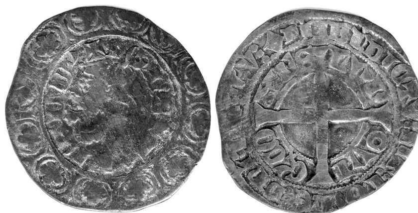
A-05 / 2.90 g.

The pellet left of the initial cross on the obverse is clearly visible. There appears to be a crossbar in FLAND', but the A of MONETA is unclear. Although the leaf-stem after MONETA is illegible on this coin, it can be inferred from the characteristics found on the reverse that this coin almost certainly belongs to Issue V, Type 12.