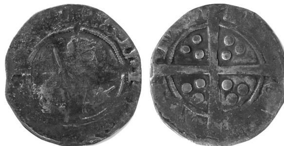
A-13 / 1.09 g.

This coin, too, is as good as unreadable. The double annulet we have indicated at the start of the obverse legend may well be a double pellet instead. The L at the end of the obverse legend is not part of the word ANGL, but rather the mintmark for Limoges – it is raised slightly above, and is slightly smaller than the other letters – this is indicative of a mint letter and not an L as the final letter in an abbreviation for ANGLie ( England ).