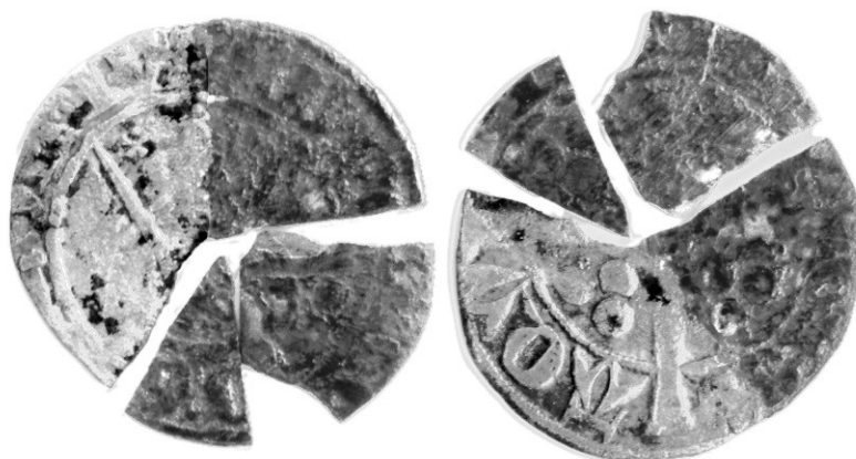
A lightened and enlarged photograph of A-18

It appears that the legs of the A on coin A-18 are simply an inverted V , and that the same punches were likely to have been used for both.