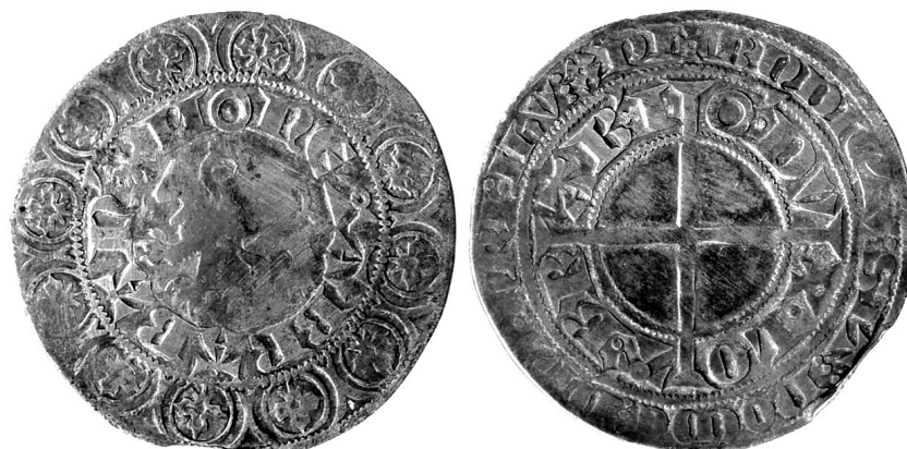
A-07 / 3.03 g.

‘Lotier’ being Lower Lorraine (or Neder-Lotharingia).