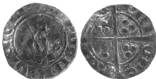
A-09 / 1.09 g.

Based on the reverse legend and portrait style, this coin was probably struck at Limoges during the 2 nd Issue. Because of the worn state of this coin, no letter is visible at the end of the obverse legend, although a double rosette does seem to be present.