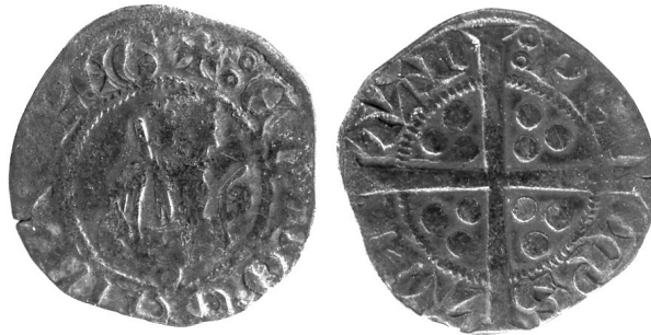
A-10 / 1.09 g.