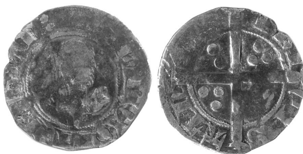
A-08 / 1.03 g.

(The following 11 coins were identified by Steve Ford [12] .)