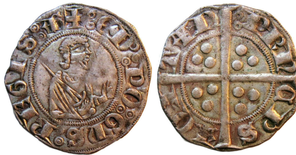
An example of a sterling from Dax Elias 189 / W/F 208-8b (private collection)

In order to give the reader an idea of what this type of coin looks like in nice condition, here is a sterling struck for the Black Prince in Aquitaine: