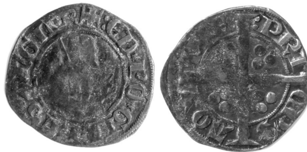
A-15 / 1.26 g.

Because of the condition of the coins, the attributions for the 11 Albecq sterlings are tentative at best, and the attribution of A-14 to the La Rochelle mint is no exception. However, this coin does seem to match the characteristics of Elias 196c, although we would say that on A-14 the little cross can be found after every word. We are fairly certain that the obverse legend ends with an R .