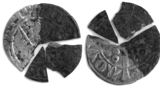
A-18 / 0.62 g.