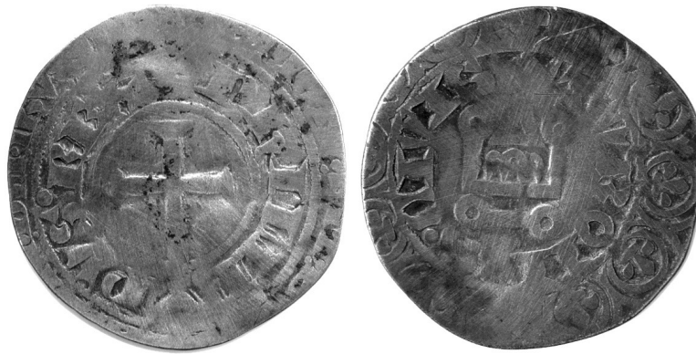
A-01 / 2.19 g

This coin appears to have been clipped. Very little of the obverse, outer legend can be seen.