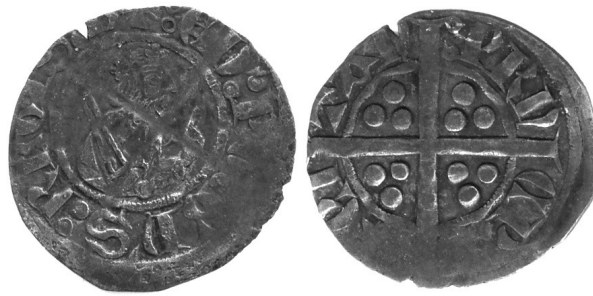
A-16 / 0.87 g.