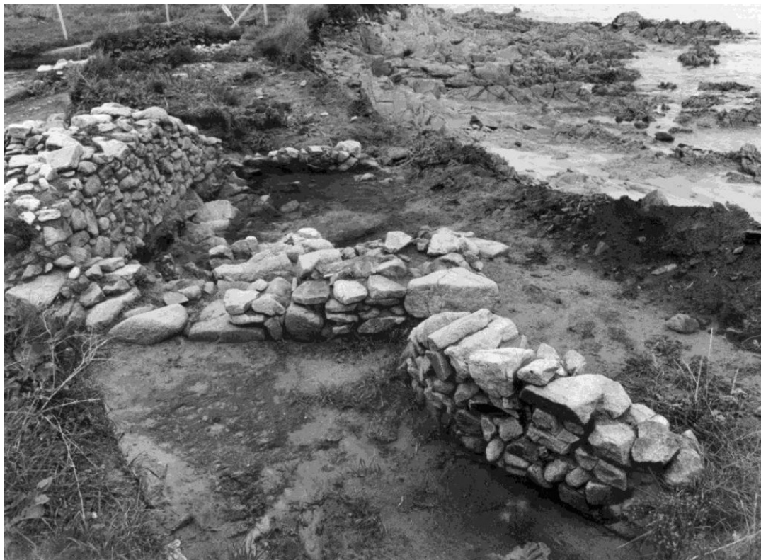
Building 3 of the Albecq site, where the coins were found, seen from the east. (de Jersey fig. 5) [1]