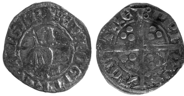
A-14 / 0.94 g.