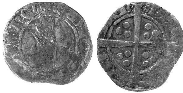
A-12 / 1.08 g.

Elias 192 Withers/Ford 212 Limoges, 2 nd Issue