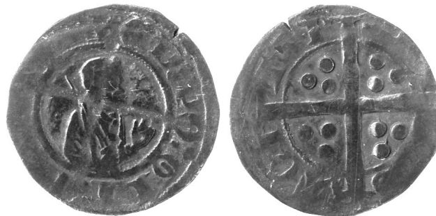
A-11 / 1.02 g.

Parts of the legends on this coin are easy to read, while other areas are not. Interpunction between the words on the obverse is not visible, but a double annulet at the beginning of the legend obverse and reverse is. This coin is a 'no mint letter', 2 nd issue coin from Poitiers.