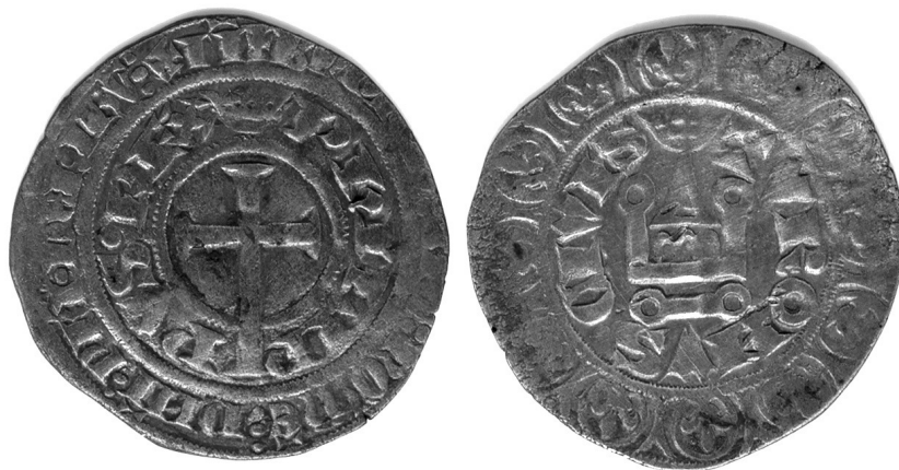
A-02 / 3.11 g.

Although this is the most legible of the 3 French coins, there is only the faintest trace of a pellet visible after TVRONVS. The V's differ from the other 2 coins.