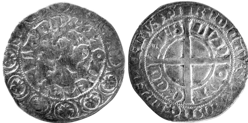
A-04 / 2.97 g.

OBV • ✠ MONETA + FLAND' REV LVD OVI CD MES