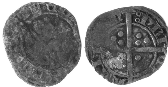
A-17 / 0.97 g.

The Q on the reverse is rather unusual, almost as though the die-sinker was unsure of how to make this letter. He seems to have created an upside-down and backwards G (cf. REGIS on the obverse).