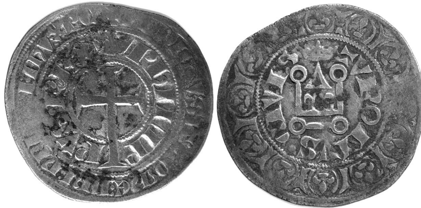
A-03 / 3.07 g.