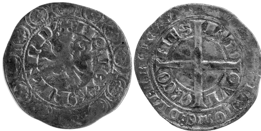
A-06 / 2.82 g.

OBV • ❖ MONETA [❖] FLAND' REV LVDOVICVS MES