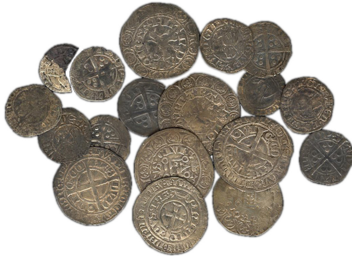
The Albecq Hoard (1995) (de Jersey fig. 7) [1]