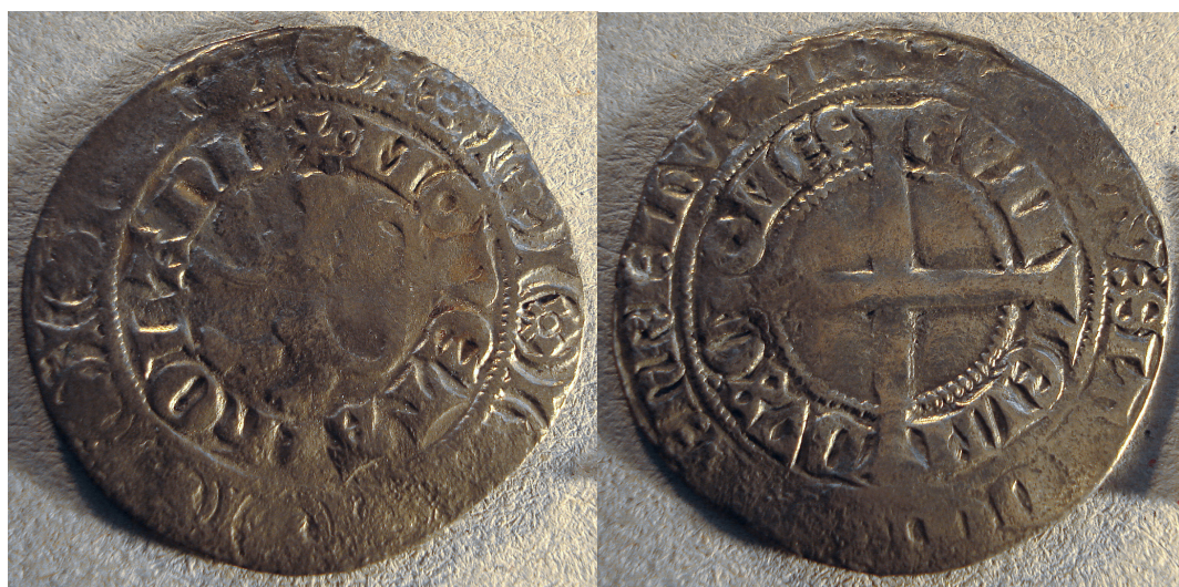
K018 The border leaves of K018 are unusual and not voided.